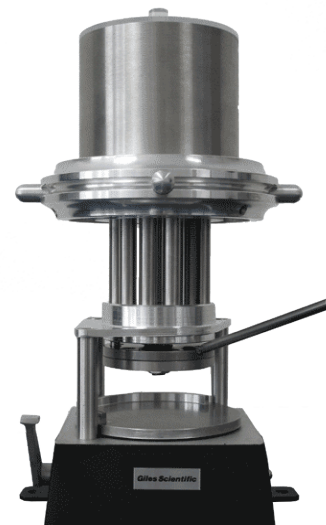
Peni Cylinder Dispenser