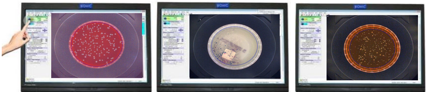
21 inch Touch Screen