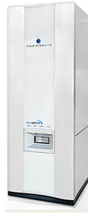
VITEK ® MS (bioMérieux)