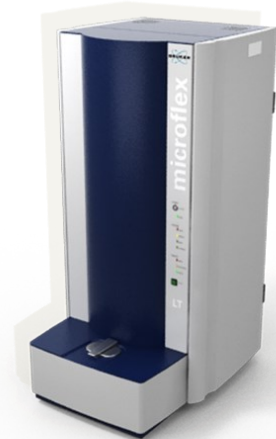
MALDI Biotyper (Bruker)

A complete AST-ID solution for the microbiology lab Send ID results from MALDI to BIOMIC ® V3 via LIS/LIMS