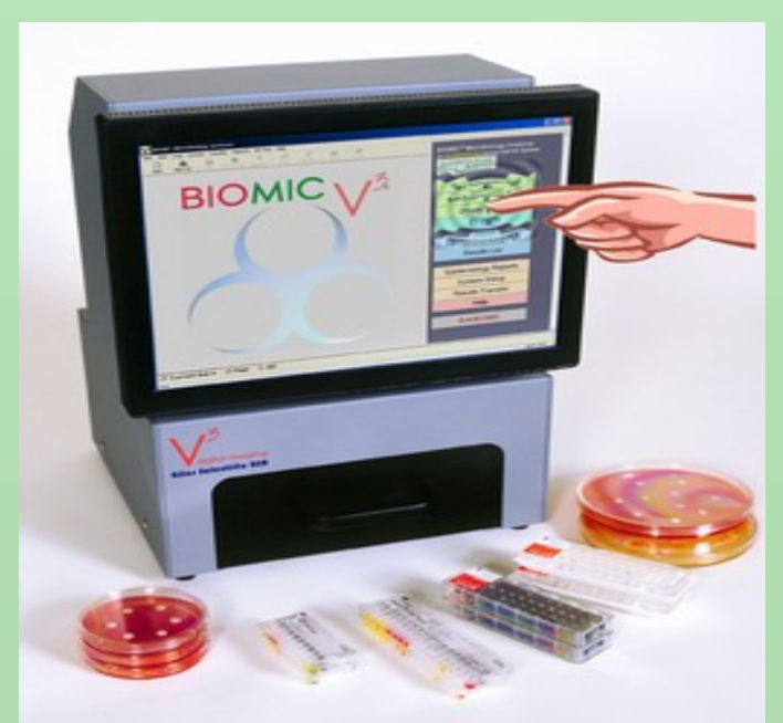
BIOMIC Image Analysis System

The plate is placed in the BIOMIC tray and scanned. Zones of inhibition are measured and compared to standards for interpretation. Discordant results are flagged for technician review. This study was done on the system shown to the left. On the right is the V3, a more recent addition to the BIOMIC inventory, which is also capable of reading biochemical identification strips.